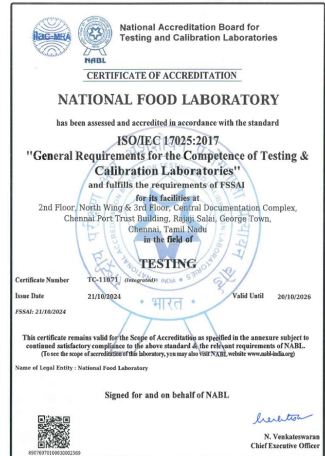
FSSAI Integrated Certificate