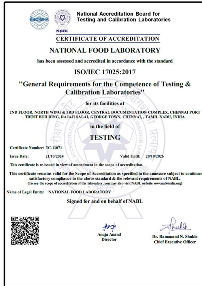
NABL Accreditation Certificate

https://nabl7t.s3.ap-south-1.amazonaws.com/live/Certificate%20%20TC-11071TC-11071-FSSAI_20251017135358.pdf?X-Amz-Expires=172800&X-Amz-Algorithm=AWS4-HMAC-SHA256&X-Amz-Credential=AKIAXRKWBCMYL2RHPK7D/20260422/ap-south-1/s3/aws4_request&X-Amz-Date=20260422T114202Z&X-Amz-SignedHeaders=host&X-Amz-Signature=6264c5a0f6ad9757f47a3ee70005bac99578a234134498cdbdfe63c4240dc7e2